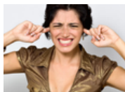
The #1 trick to REVERSE Tinnitus