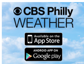
New Weather App