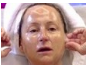
Wrinkle Trick Horrifies Surgeons