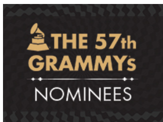
GRAMMY Nominees Announced