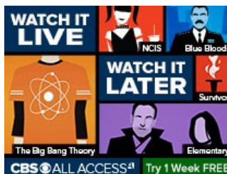
Introducing #CBSAllAccess! Stream CBS3 live, next-day, or on demand