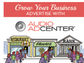
"Get Started Now"