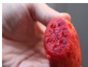
1 Fruit That Fights Diabetes