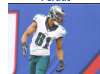
PHOTOS: Eagles 34 Giants 26