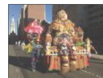
2015 Mummers Parade