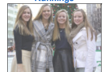
Christmas Village In...