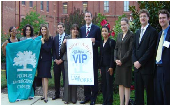
Staff and Volunteers at a homeownership clinic at the People's Emergency Center, July 2007

Homeownership Clinics: 38 summer associates participated in two homeownership clinics; one at Congreso and one at the People's Emergency Center. A total of 33 clients were assisted at both clinics.