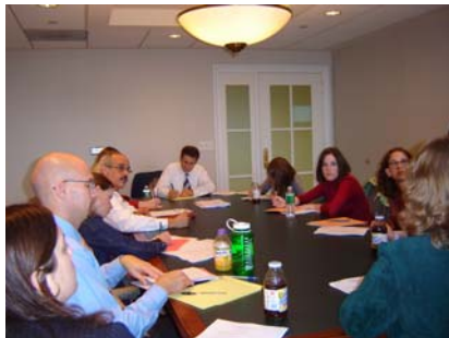
VIP Custody Training at Pro Bono Opportunities Day

Generously hosted by Montgomery McCracken Walker and Rhoads, PBOD '07 inspired and educated more than sixty lawyers who were new to pro bono work. Trainers from Ballard Spahr Andrews & Ingersoll, Community Legal Services, Cozen O'Connor, Fox Rothschild, and the Law Offices of Michael E. Fingerman