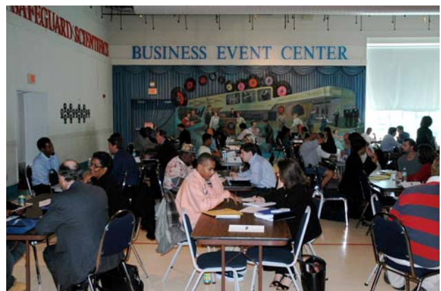
Corporate Pro Bono Day at The Enterprise Center, September 07

on the essential legal needs of small businesses to the corporate counsel volunteers.