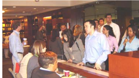
Registration for Summer Associates Day, June 2007

concluded with an informal lunch for the students attended by judges from the First Judicial District of Pennsylvania.