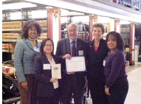
Community Legal Services Energy Unit Staff

Community Legal Services Energy Unit Philadelphia Legal Assistance Intake Unit