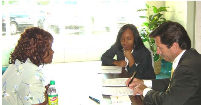
VIP volunteers meeting with a client at a recent clinic.